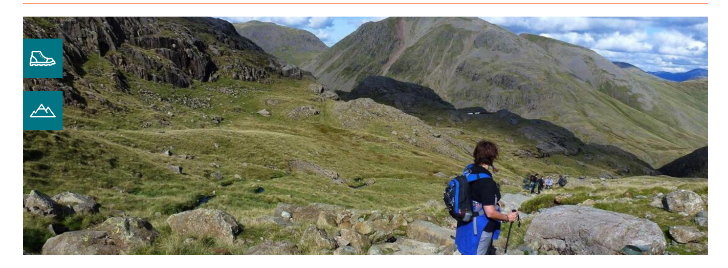
In aid of your choice of charity