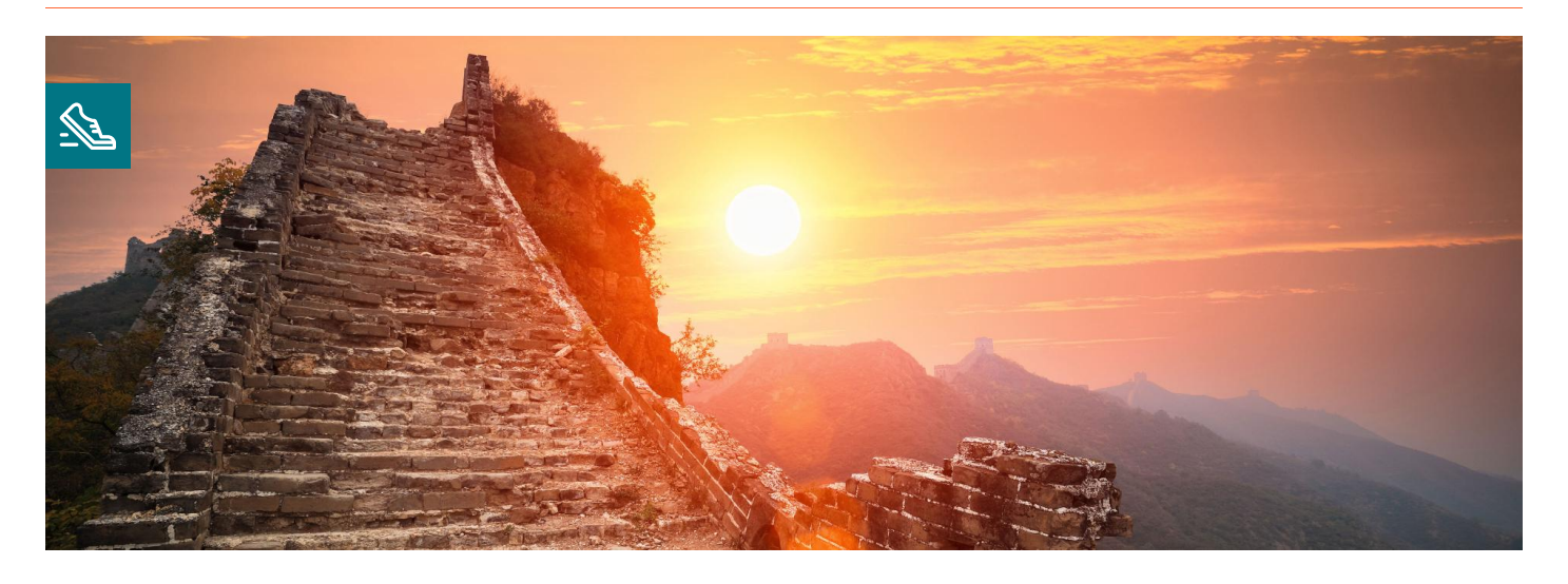
In aid of your choice of charity