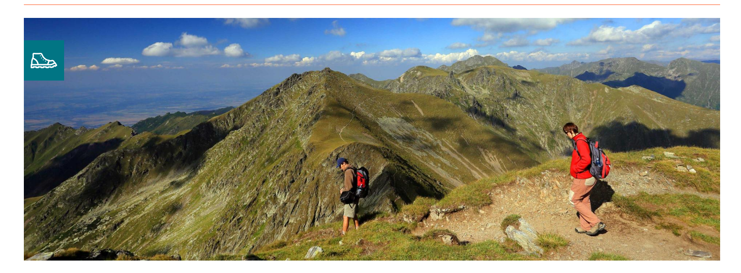
In aid of your choice of charity