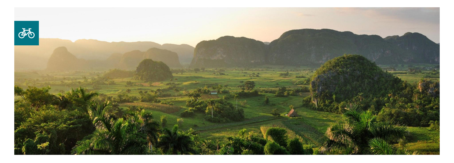
In aid of your choice of charity