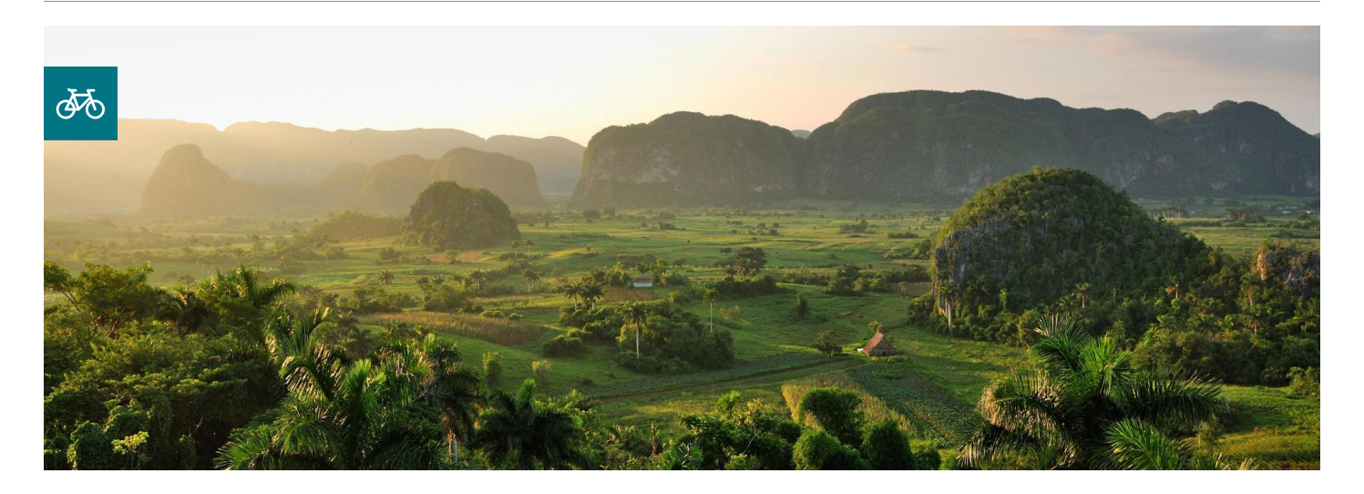
In aid of your choice of charity