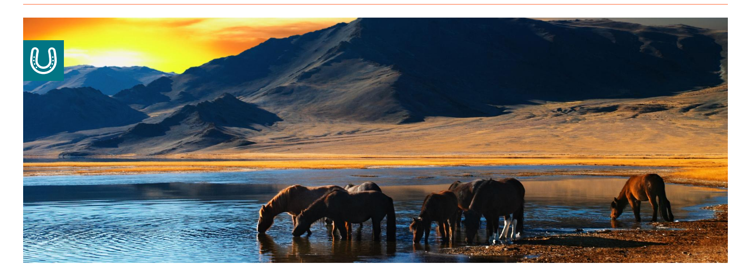
In aid of your choice of charity