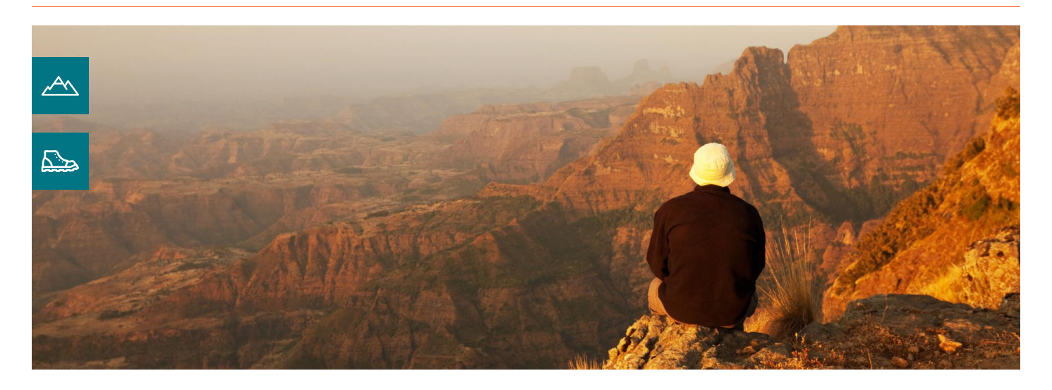
In aid of your choice of charity