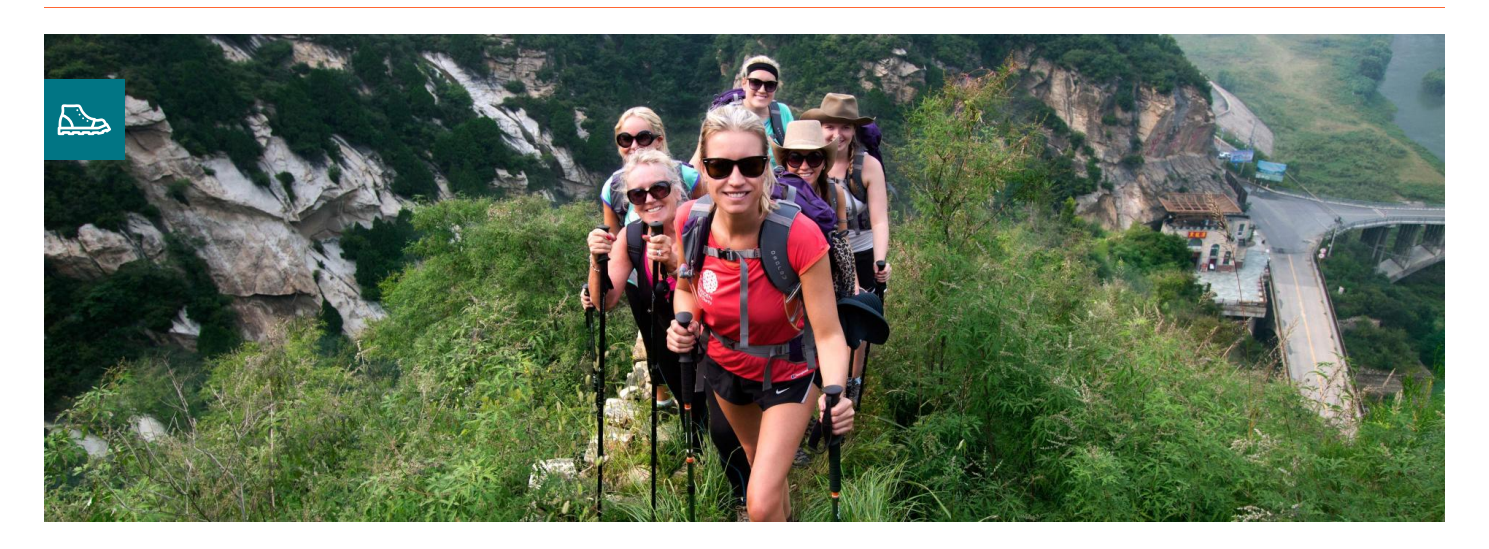
In aid of Pilgrims Hospices in East Kent