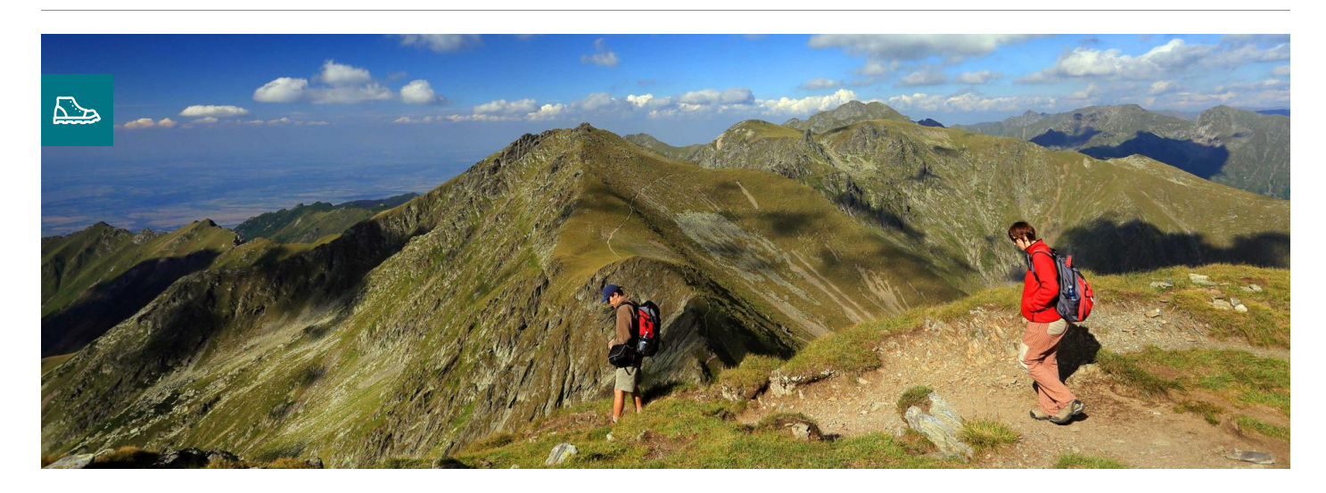
In aid of your choice of charity