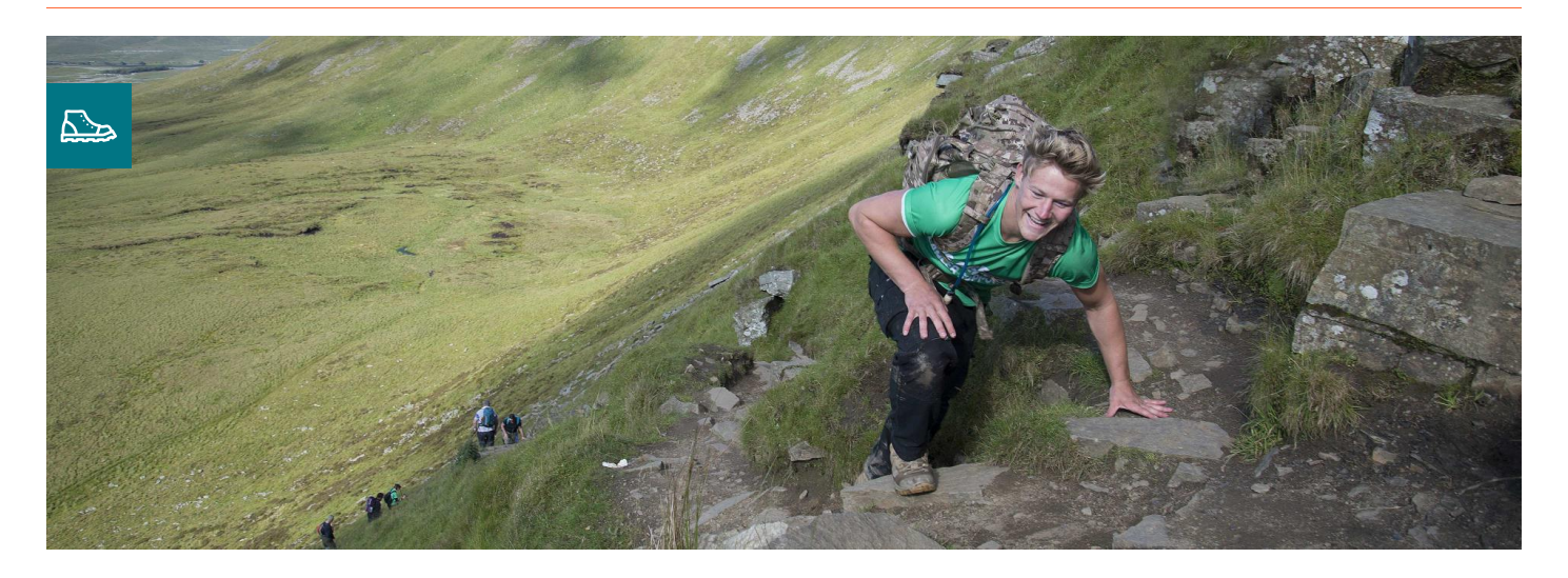
In aid of your choice of charity