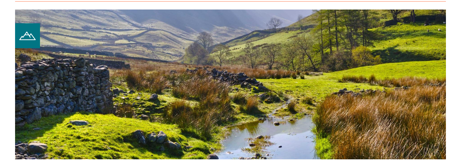
In aid of your choice of charity