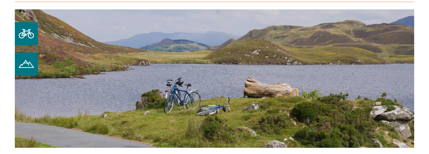
In aid of your choice of charity