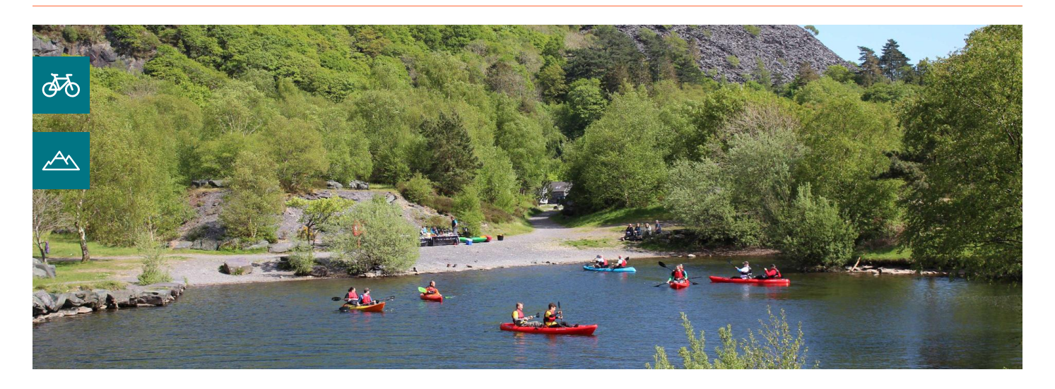
In aid of your choice of charity