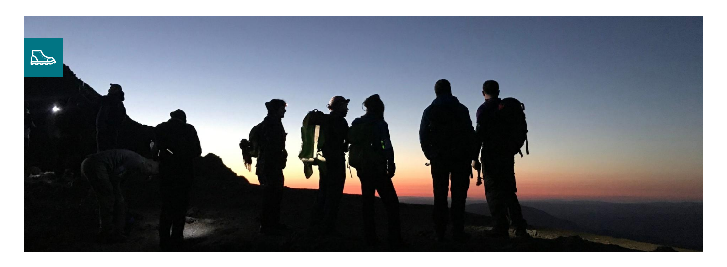
In aid of NSPCC 30 Sep - 30 Sep 2017