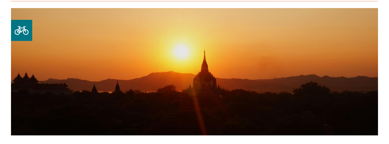
In aid of your choice of charity