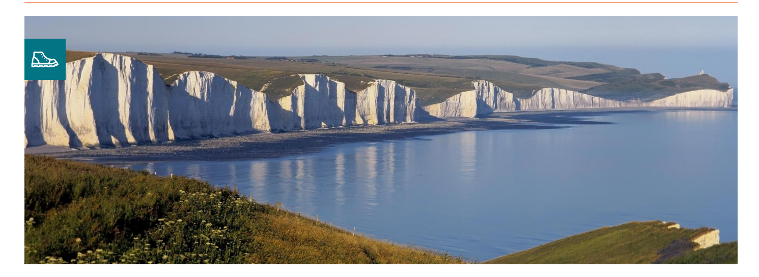
In aid of Future Dreams