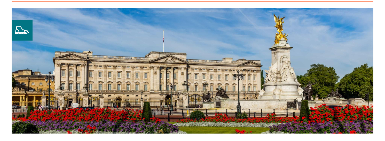
In aid of your choice of charity