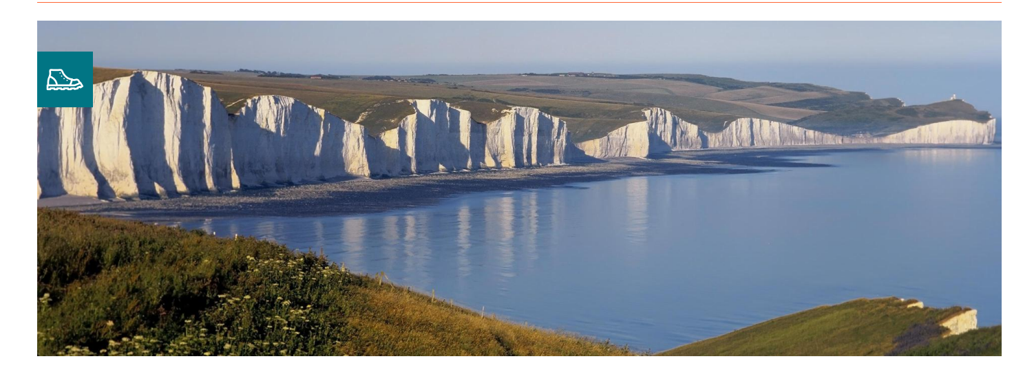
In aid of your choice of charity