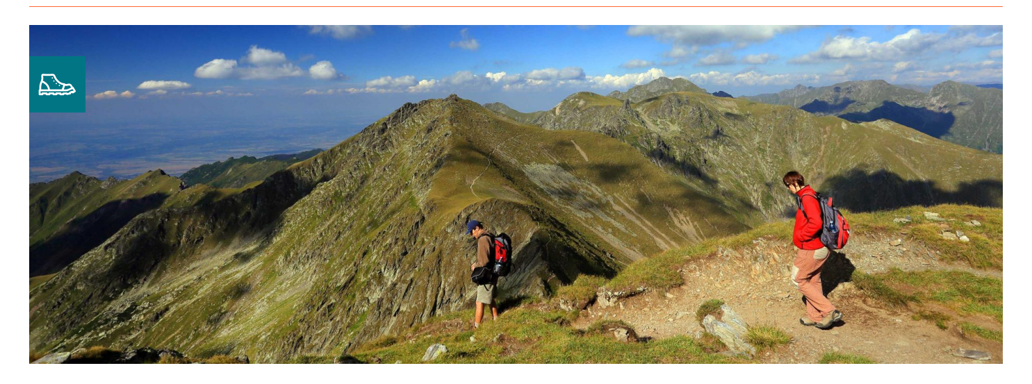
In aid of your choice of charity